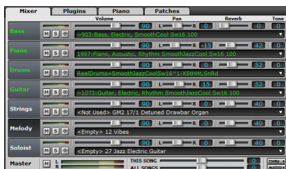
A new redesigned onscreen mixer, with volume/panning/reverb/toner sliders settings. Tabs for on-screen pianos (one for each track), and plug-ins.