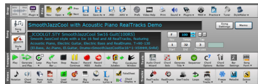
Toolbars are organized by functional groups, with an Enhanced Drop Station, a Single button to choose a song or style, easy changing of key signatures, and an elaborate style descriptions on screen with a Style memo that shows a summary list of instruments.