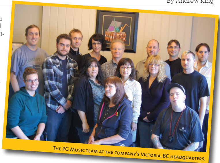
THE PG MUSIC TEAM AT THE COMPANY'S VICTORIA, BC HEADQUARTERS.

For the uninitiated, Band-in-a-Box allows users to type in the chord progression for any song they might be working on, choose the musical style, and the program will automatically generate a complete arrangement using realistic piano, bass, drum, guitar, string, and horn tracks recorded by top session musicians.